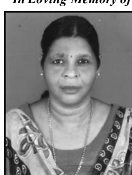
Late MEENA KUMARI